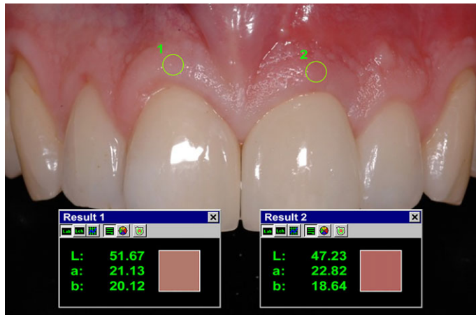
Fig. 1. Spectrophotometric color evaluation of the buccal mucosa at the control tooth 11 and the test implant 21.