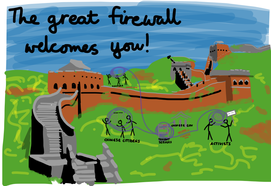
Illustration by Willow Brugh

snuck onto a laptop through infected PDF files. In the case of WeChat, the user is opting in to these capabilities, entrusting what may be a well-meaning social messaging service with “god mode” while unknowingly providing an easy backdoor on their phone for adversaries higher up the Chinese cyber-war food chain.