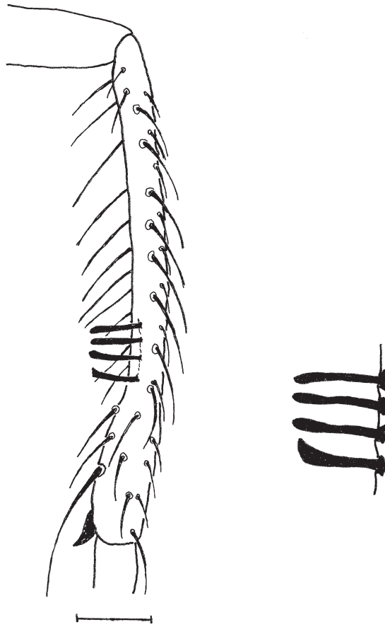
Fig. 1: Teuchophorus quadrisetosus sp. n., hind tibia (scale bare = 0.1 mm)

Wing: Hyaline with a slight grayish infuscation, veins dark brown; with a basal swelling between R_1 and costa; M practically straight; length ratio of dm-cu cross-vein to length of distal section of CuA: 0.4; lower calypter yellow with brown setae; halter stem and knob yellow.