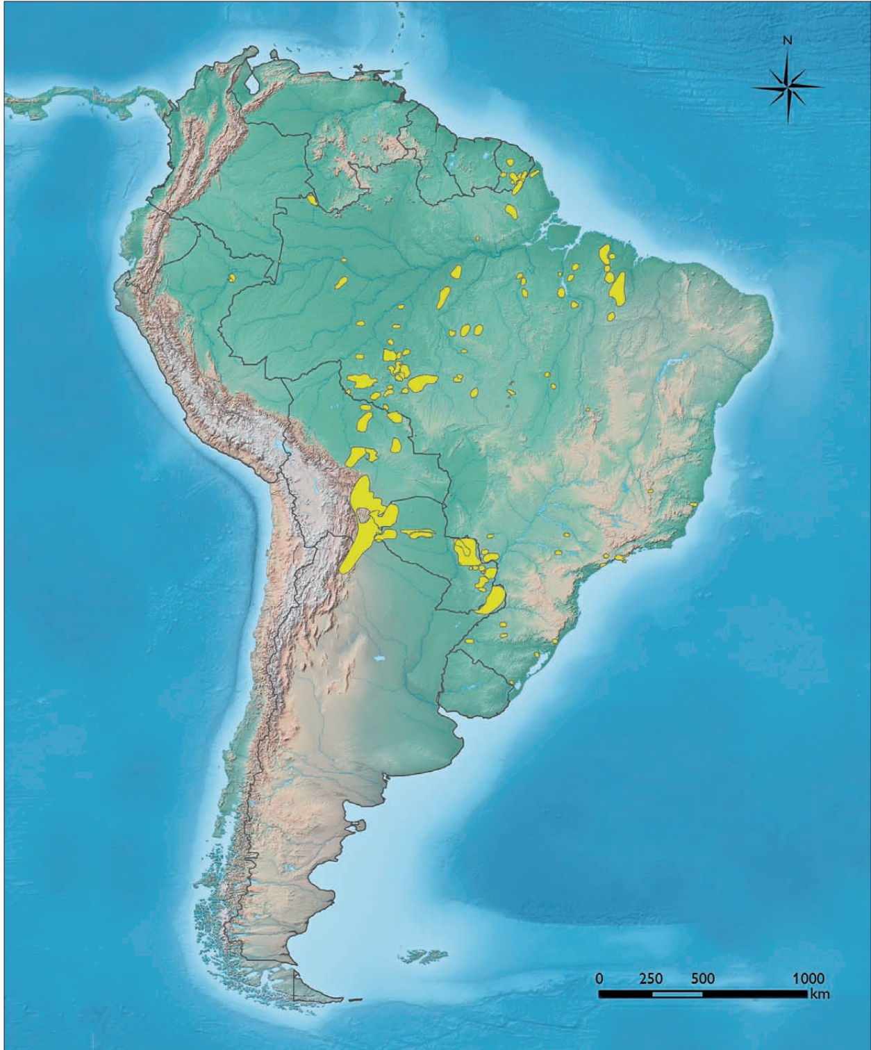
Figure 2. The distribution of the extant Tupian languages (L. Eriksen).