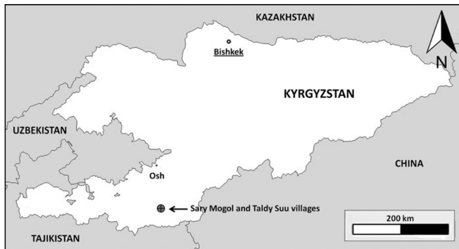
Fig. 1. Map of Kyrgyzstan to show the study site (circled) in the Alay valley.

Dog faeces were sampled in Sary Mogol and other villages over the same period. Echinococcus multilocularis DNA was amplified from dog faeces found in Taldy Suu village (72°58'15.75"E, 39°42'24.41"N) situated 7.4 km from the small mammal sampling spot (see van Kesteren et al. , 2013).