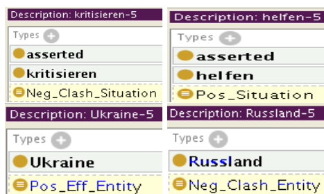
Figure 3: Sentiment Inferences

The verb “to criticize” is a a1a4_neg_effect verb, the direct object as well as the subclause inherit a negative effect. For our example (“Russia has criticized Europe for the fact that it helps the Ukraine”) we get (see Fig. 3): “helfen-5” is a positive situation 3 , thus, a polarity clash occurs (“criticize something positive”).