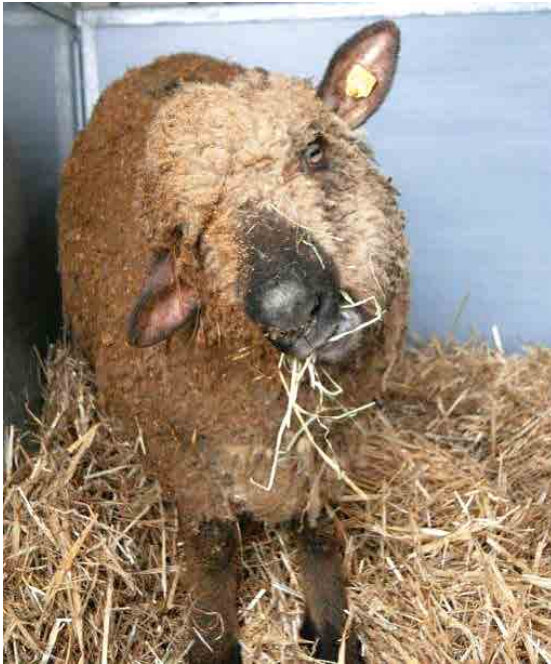
Figure 2: Sheep affected by neurolisteriosis presenting with head tilt, chewing and swallowing difficulties, drooping ear, eyelid and lip.

infection and lower mortality, which could be due to a more effective immune response (Jungi et al., 1997; Oevermann et al., 2010a).