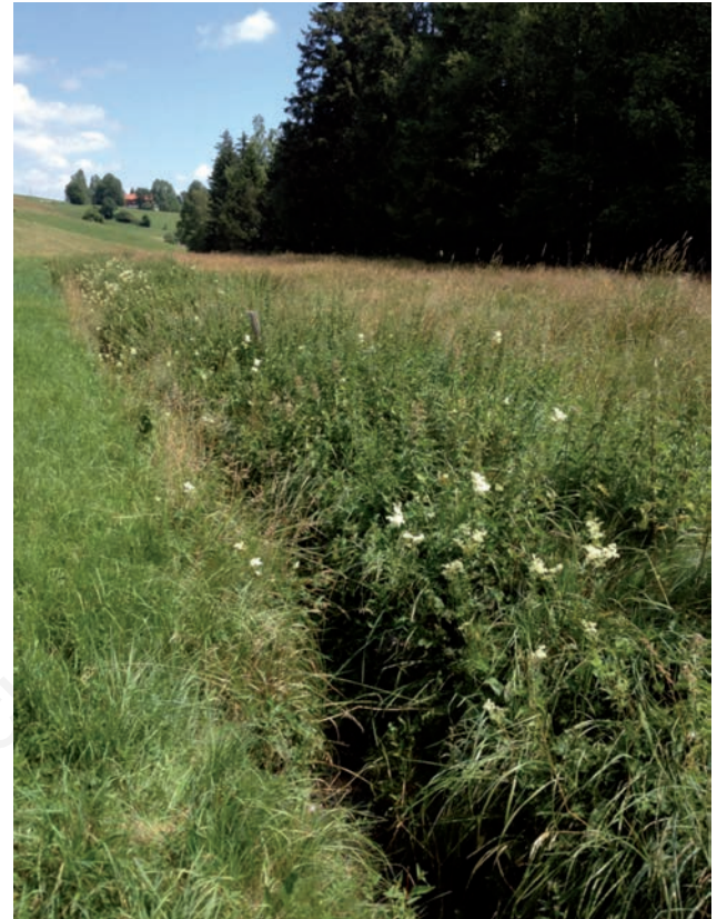
Figure 3. Drainage ditch in a swampy area making a potentially suitable habitat for Galba truncatula .