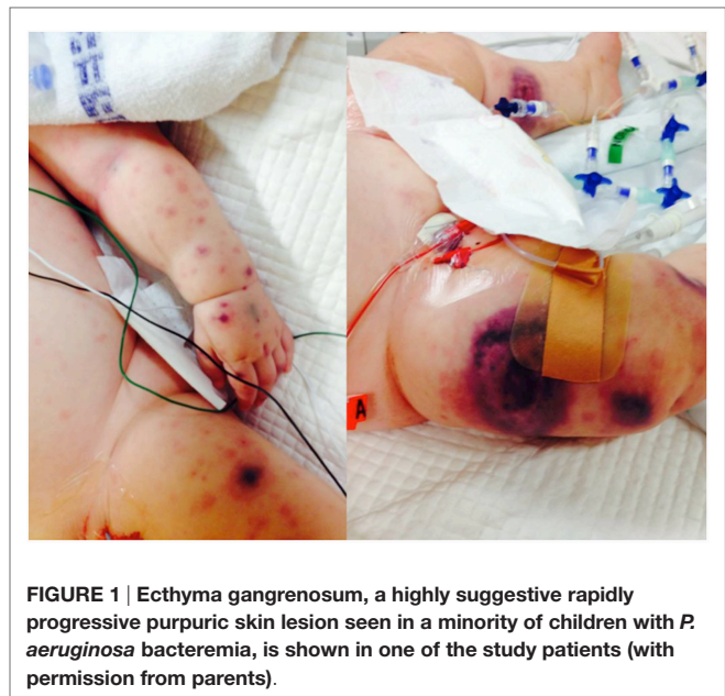
FIGURE 1 | Ecthyma gangrenosum, a highly suggestive rapidly progressive purpuric skin lesion seen in a minority of children with P. aeruginosa bacteremia, is shown in one of the study patients (with permission from parents).

F, female; M, male; mo, months old; CRP, C-reactive protein; WCC, white cell count ( \times 10^9/l ).