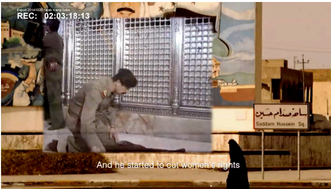
Fig. 2: IRAQI ODYSSEY (Samir, IQ/CH/DE/AE, 2015), 02:03:18.