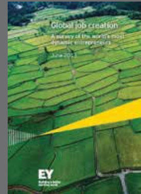
Global job creation surveys