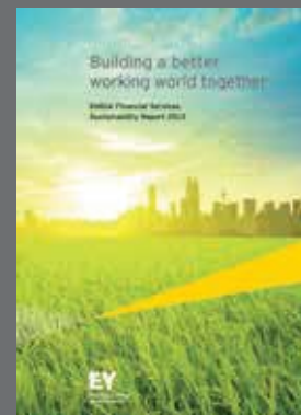
EMEIA Financial Services Sustainability Report