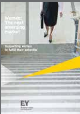
Women: The next emerging market