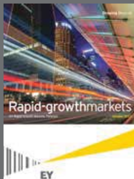
Rapid-Growth Markets Forecast series