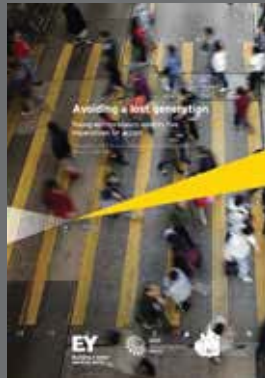
Avoiding a lost generation