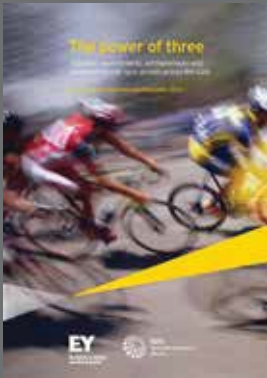
The EY G20 Entrepreneurship Barometer series