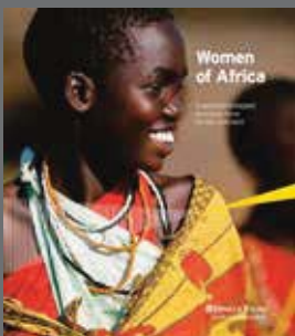
Women of Africa: A powerful untapped economic force for the continent