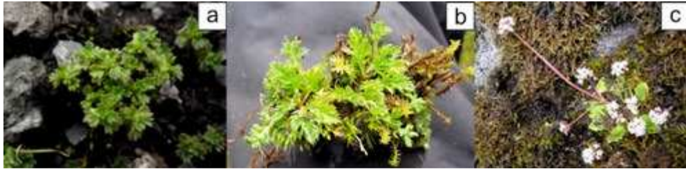
Fig. 2. Photographs of some of the overlooked species records for Peru. a. Aphanes parvula ,