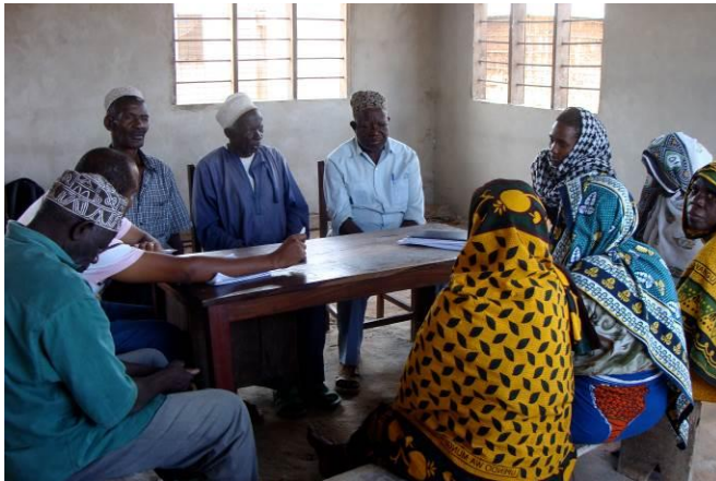
An active and attentive moderator (white shirt on the left) facilitates a focus group discussion about health care and agency with older women and men in Dar es Salaam, Tanzania.