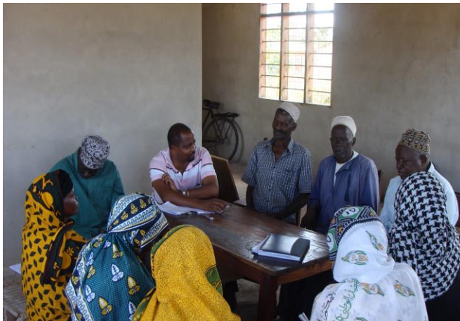
Approaching gender balance in a focus group discussion with older women and men and a younger moderator (white shirt on the left) in Dar es Salaam, Tanzania.