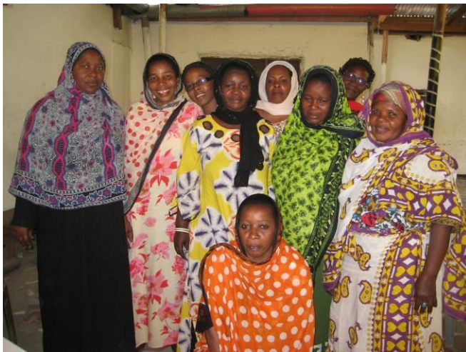
Focus group discussion with traditional birth attendants in Dar es Salaam, Tanzania.

Qualitative research is usually an explorative process and therefore flexible, iterative, reflective, non-predictable and contextualized (Silverman 2006). Unlike in quantitative studies, modifying the research question is possible and even recommended (but never during an active FGD session!) as is generating new hypotheses and pursuing new insights if the data suggest doing so. At the same time, a good, general and well-framed research question is essential to the success of a qualitative study.