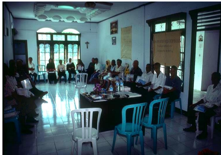
Focus group discussion with elderly participants about ageing, health and care in Tahuna (North Sulawesi), Indonesia. Wall posters state the FGD topic, objectives and questions.