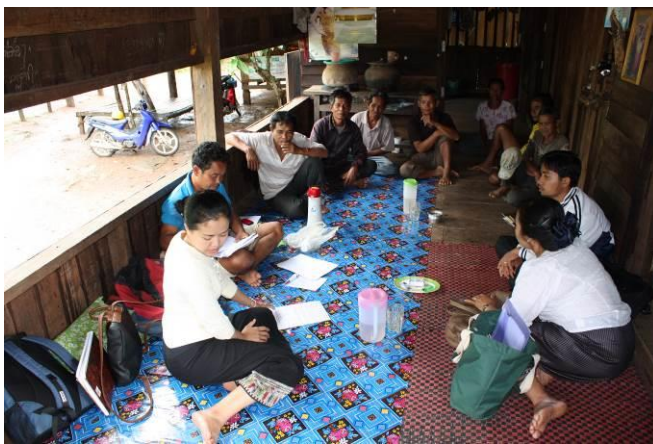
Focus group discussion with village leaders and voluntary village workers in Saravan Province, Laos, about risks, experiences and requests regarding trematode diseases. Moderator, minute taker and observer (in the foreground) are state health professionals (photo by P. van Eeuwijk).

The typical size of a focus group discussion is 6 to 12 participants; however, smaller groups are also fine and informative, giving all participants enough time and opportunity to share. A group of only 3 to 4 participants is called a 'mini group'. A general rule of the thumb is that the more experience and knowledge the participants have on the given subject, the smaller the group could be.