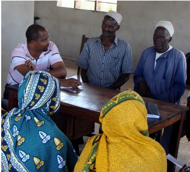
The role of the moderator (left, white shirt) in a focus group discussion is crucial – here with older women and men in Dar es Salaam, Tanzania.

and is only possible when data collection and interpretation take place iteratively (Carlsen and Glenton 2011); that is, when the researcher reviews and thus knows the data collected and can assess/evaluate them for completeness and sufficiency.