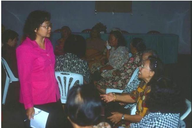
Focus group discussion with two sub-groups of older women in Tomohon (North Sulawesi), Indonesia, about body, health and care. Moderator plays an active role in stimulating discussion. Wall poster contains FGD questions.

during or right after the discussion. Some FGDs also employ an observer to monitor the social dynamics between the participants when they discuss particular questions. FGDs may last long, from one to even several hours. It is possible to incorporate group exercises (e.g. discussing a realistic case or a provocative hypothesis) and projective techniques (i.e. relatively indefinite and unstructured stimuli are provided to the participants who are asked to structure them in any way they like, which unconsciously projects their own desires, expectations, hopes, fears, and/or repressed wishes) into the course of the discussion, if appropriate for the research topic.