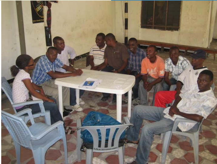
Focus group discussion with men in Dar es Salaam, Tanzania, about the use of health services during pregnancy and delivery.