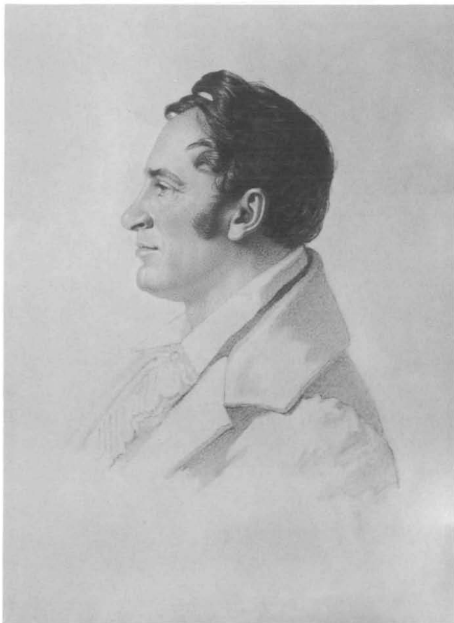
Fig. 1. Schoenlein in his Zürich period. Pastel. Artist unknown. This portrait, which has unfortunately disappeared, used to hang in the Department of Medicine, of which Schoenlein was the first Director, in the Kantonsspital.