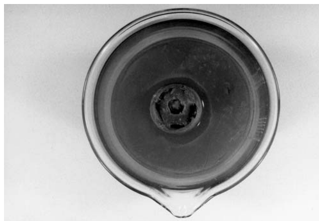
Figure 1. Cement spacer in a cylindrical glass with a zone of inhibition of the added staphylococci.

The cylindrical spacers were placed in the middle of cylindrical glasses (Duran®, Schott, Mainz, Germany) containing 440 ml of liquid (50 °C) sterile MH agar so that 2–3 cm of the spacer were still above the level of the agar surface. After the agar became solid at room temperature, suspensions of staphylococci were prepared as above and streaked with a swab tightly over the entire agar surface around the cylindrical cement spacer. The cylindrical glasses with the spacer in the agar were incubated at 37 °C without CO 2 and diameters of inhibition were measured after 24 h and incubation continued for some days (Figure 1). The cylindrical spacers that showed an inhibition of the staphylococci were then transferred to a new cylindrical glass with liquid (50 °C) sterile MH agar but the amount of agar was diminished by