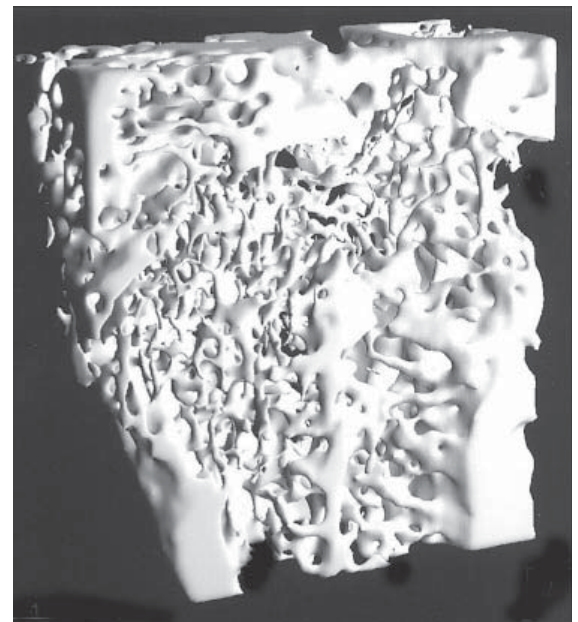
Fig. 2. 3-D reconstruction of \mu CT slices for a tumor-bearing bone with placebo treatment (a 6-mm region is shown)