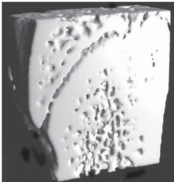
Fig. 3. 3-D reconstruction of \mu CT slices for a tumor-bearing bone with interventional ibandronate treatment (a 6-mm region is shown)