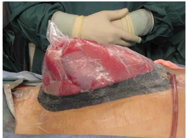
Figure 7. Suction was applied under constant topic negative pressure (50–75 mmHg), and Bogota-VAC collapsed.

traumatic brain injury and one patient with isolated ACS after blunt abdominal trauma decreased significantly ( p = 0.01 ; paired t test) after decompressive laparotomy and treatment with Bogota-VAC (IAP: 10 \pm 2 mmHg) and remained low, measured via urinary bladder pressure. The intracranial pressure in the four traumatic brain injury patients decreased from 42 \pm 13 to 15 \pm 3 mmHg after abdominal decompression. Cerebral perfusion pressure ( 57 \pm 14 mmHg) increased to 74 \pm 2 mmHg. On average, treatment