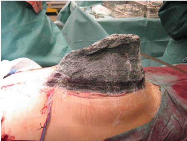
Figure 5. The TRAC-PAD ® was positioned on the hole of 1–2 cm in diameter and connected to a vacuum pump by a container. When suction was applied the layers with the foam collapsed.

connected to a vacuum pump by a container (V.A.C. ® Vacuum Assisted Closure; KCI, San Antonio, TX, USA). When suction was started and the foam collapsed, the VRC decreased significantly under topic negative pressure of 50–75 mmHg (Figure 5).