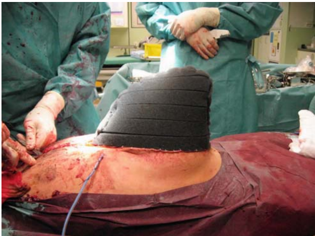
Figure 3. Bogota bag was encapsulated in the black polyurethane foam of the conventional VAC system.