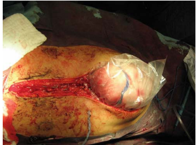
Figure 2. A thin isolation bag, the so-called Bogota bag, was tension-free fixed on the abdominal fascia by fascia suture.