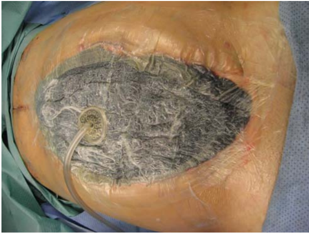
Figure 8. On average, initial treatment with Bogota-VAC was changed to conventional VAC system after 8 days.