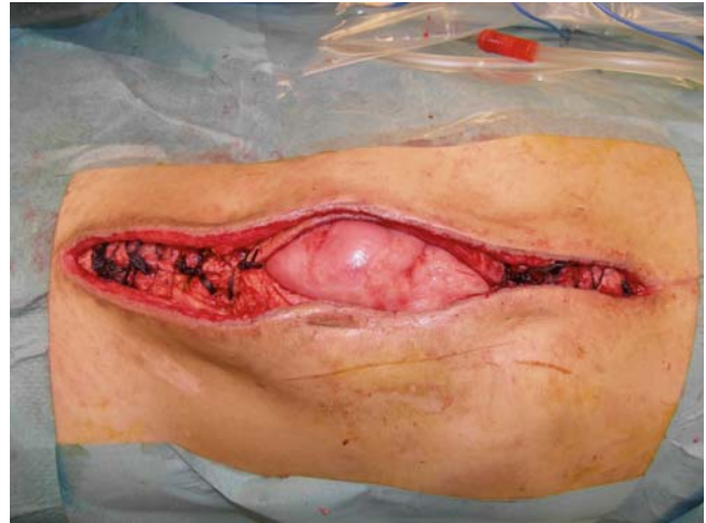
Figure 9. When the edema resolved, no necrosis was present on fascia layers and granulation tissue formation of subcutaneous tissue took place, fascia was stepwise closed by suturing.