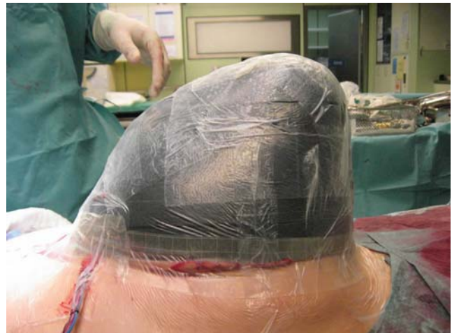
Figure 4. The skin was cleaned with benzine. Adhesive dressing drapes of the VAC system were trimmed as a patchwork to seal the wound.

different TAC techniques. VAC and zipper system resulted in significantly lower VRC compared with bag silo closure [9]. Due to these results, we searched for an abdominal temporary closure technique combining the advantages of both bag silo closure and VAC. A newly modified TAC technique for efficient treatment of open abdomen condition after ACS (Figure 1) was introduced. To our knowledge, this is the first report using the Bogota-VAC system for treatment of patients with ACS.