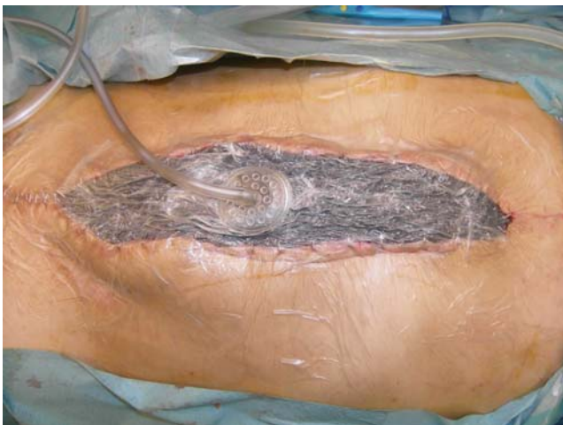
Figure 10. Second look operations were performed every 2–3 days.