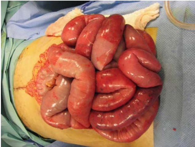
Figure 1. Patient 1 with open abdomen condition after damage-control laparotomy.