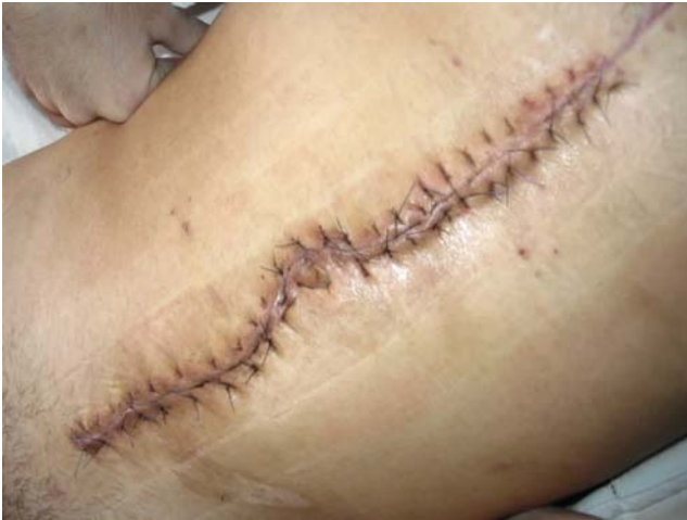
Figure 12. Final situation after secondary wound closure.

nursing. Transparency of the so-called Bogota bag as part of Bogota-VAC allows continuous assessment of the intestinal bowel and for early detection of perfusion changes, caused for example, by ischemia at an earlier time point compared to conventional VAC system. As a result, early surgical intervention can be performed if needed. Well-known complications of the application of conventional VAC system in conditions of open abdomen include progressive ACS and fistula formations [7, 12, 13]. These problems may be prevented using the Bogota-VAC: a recent in vitro study using bag silo closure measured a VRC of approximately 3,000 ml [9]. Therefore, the Bogota bag part of Bogota-VAC demonstrated highest VRC of all TAC techniques and helped to prevent ACS.