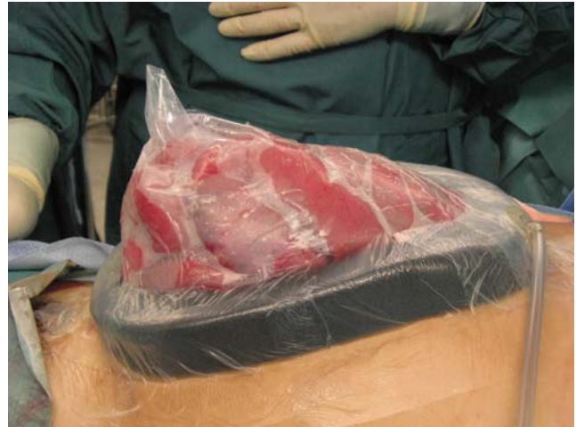
Figure 6. Patients 2–5: in addition to patient 1, Bogota bag was fixed tension-free via fascia suture to the abdominal fascia. In contrast to the first patient, a ring shaped black polyurethane foam of the VAC system was put into the gap between Bogota bag, abdominal fascia and the wound edge fixed to the skin edges by staples. A hole was punched and the TRAC-PAD ® of the VAC system was positioned on the occlusive seals. The TRAC-PAD ® was connected to a vacuum pump by a container.

In a prospective study Bogota-VAC application was tested in five patients. Intra-abdominal pressure (IAP: 22 \pm 2 mmHg) of four patients with ACS after severe