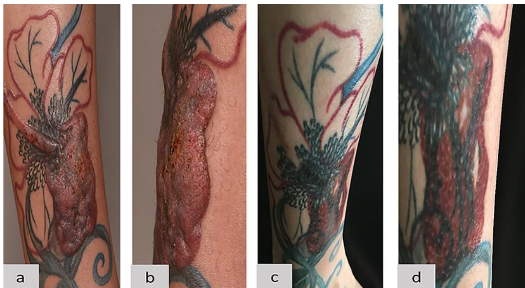
Fig. 1. Clinical images of the pseudolymphomatous reaction on the patient's right lower extremity within a red part of her tattoo. a, b A red massive infiltrated tumor sharply demarcated and limited within the red part of her red-, black-, and green-colored tattoo 9 months after the tattooing procedure. c, d Complete resolution of the pseudolymphomatous reaction 2 years after the initial 6-month treatment with topical corticosteroids.