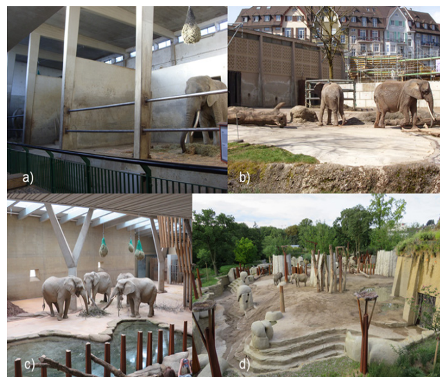
Figure 1. Comparison of the old and new African elephant exhibit at Zoo Basel. Old indoor (a) and outdoor (b) exhibit during the first period of observation and both areas of the new exhibit (c,d) during period 4 and 5 of observation.

evidence by specific reports (Braidwood 2013; Jacobs 2011; Lucas and Stanyon 2016; Thomas et al. 2001), uncertainties concerning the expectable effects of a new exhibit on stereotypic behaviour of an elephant remain. The present case report aims to (I) document changes in the amount of swaying in an elderly female African elephant ( Loxodonta africana ) during and after the reconstruction of a new elephant exhibit at Zoo Basel. Additionally, (II) potential influencing factors were assessed to identify parameters that might be most critical. Ideally, consideration of these parameters may provide further helpful advice to elephant-keeping facilities in optimising their husbandry conditions.