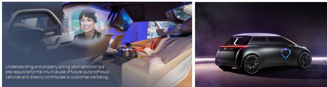
Figure 1. Emotion awareness: crucial for vehicle interaction with passengers and road users.

Susanne Müller Coaching & Consulting kontakt@susamueller.de