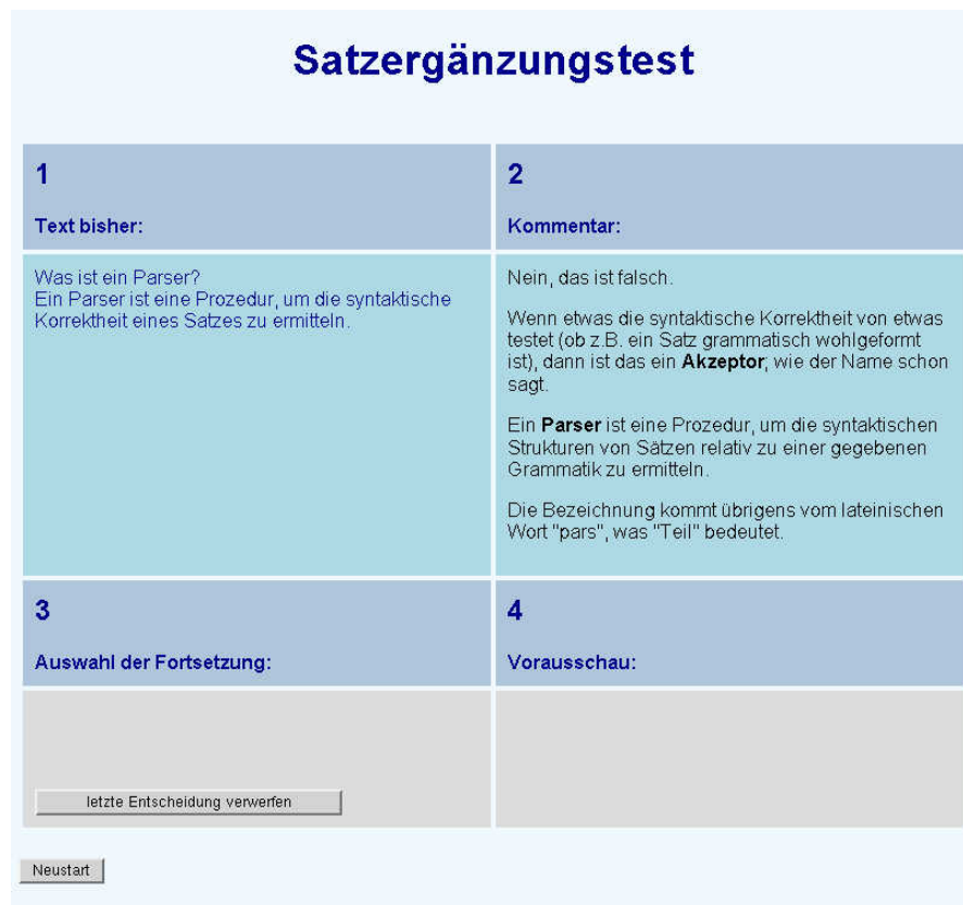
Figure 3: Snapshot of the finished SET session for answering the SET “What is a parser?”

a potentially infinite number). It would be clearly impossible to write individual comments for each of these answers. We overcome this obstacle by generating comments, semi-automatically in some cases, and fully automatically in others. The semi-automatical creation relies on the fact that each answer fragment can be rated according to its correctness and relevance for a given question. It is relatively easy to attach, to a limited number of “strategically important” answer fragments, comment fragments specifying in what way they are (in)correct and (ir)relevant. We then have SET collect the comment fragments of all answer fragments chosen by the learner, and combine them into complete and syntactically well-formed comments that refer to the individual parts of an answer and point out superfluous, missing, or wrong bits, in any degree of detail desired by the author. We can even generate comments on the basis of arbitrarily complex logical conditions over answer fragments, thus identifying, among others, contradictions in answers. That way we can generate a potentially infinite number of com-