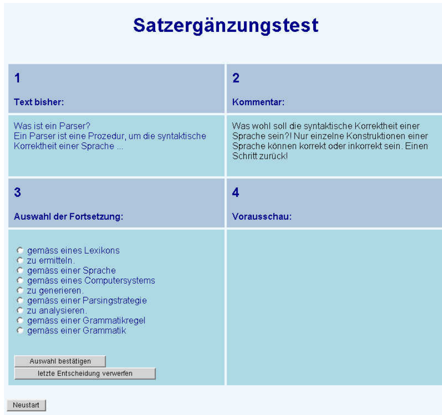
Figure 2: Snapshot of an intermidate result while answering the SET “What is a parser?”

and user choices as input. This is done by a Prolog program as the back-end for a single SET. As input it takes the SET specific Prolog automaton, the path up to now, and the current choice of the user. As output it creates the new current answer, the new list of elements to continue, the preview, comments, paths and points.