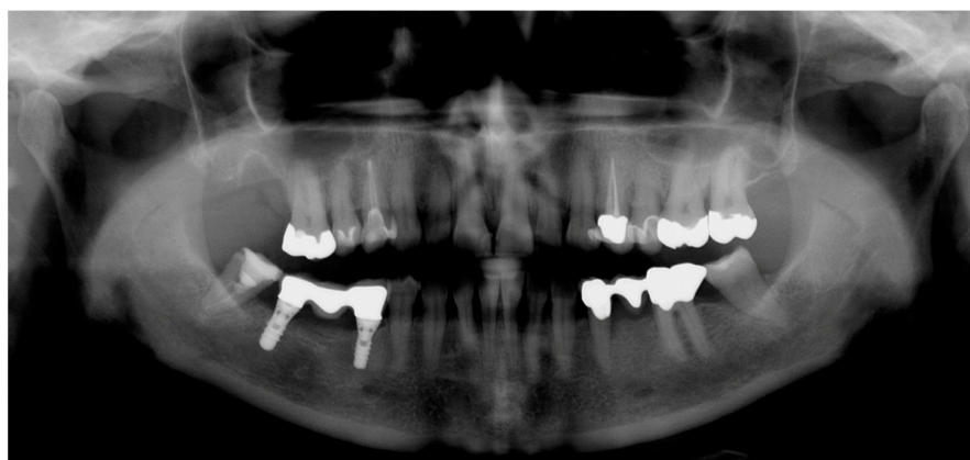
Figure 2. Panoramic radiograph (OPT).