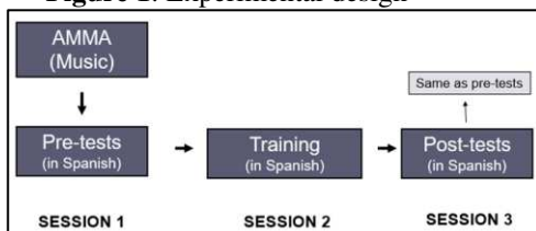
Figure 1: Experimental design

Participants took part in 3 experimental sessions (see Fig. 1). In session 1, they performed a music aptitude test (i.e., AMMA) and pre-tests. In session 2, participants were administered a perceptual training on Spanish lexical stress. In session 3, they performed post-tests (2 days after training), these tests being similar to the pre-tests they performed in session 1. All the tests (AMMA, pre-, post-tests, training) were run with Praat scripts ([1]).