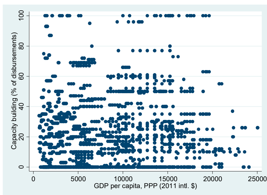
Figure 2. The share of capacity building disbursements by recipient income. Note: Each dot corresponds to one disbursement from the World Bank’s trust fund disbursement database (for all climate trust funds included in the database).

for those funds for which disbursement information is available. The sector name that seems to fit best is “Institutional strengthening and capacity building”, but it has zero positive entries in the database (even for the fund clearly identified as capacity building). We thus focus on other sectors that appear close to what we wish to capture, namely support to public administration, to central government and to sub-national government. For each entry in the disbursement database, we build an indicator that sums up the share of disbursements to these capacity-related subsectors. Figure 2 plots this indicator against the per capita income of the recipient.