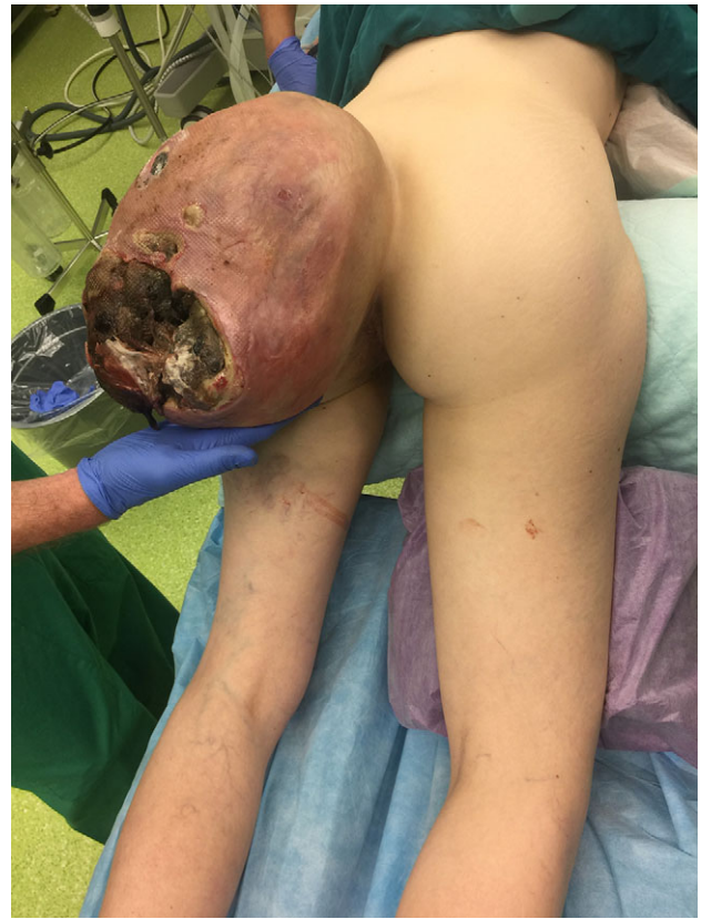
Figure 3: Clinical situation in March 2018 (3 and a half years after primary finding). A gigantic tumor arose of the left gluteal region, partially necrotic, foul and with bleeding ulceration.

Of note, any adjuvant treatment was vehemently refused by the patient.