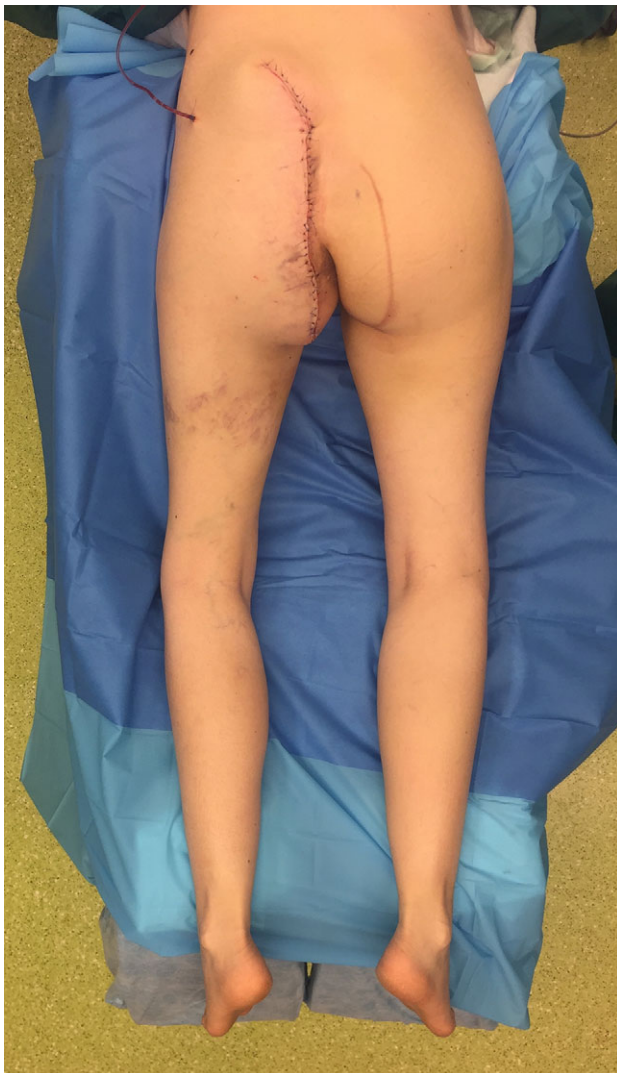
Figure 5: Intraoperative situation directly after wound closure.

Formulating any prognosis is challenging, especially since the patient did refuse to undergo any pre- or post-operative staging procedures. The effect of delayed treatment on outcome is discussed controversially [5]. Nonetheless, extended size and depth can influence outcome negatively [6]. However, the intermediate graded tumor of the extremities [6] remained untouched during the entire procedure and was entirely (R0) resected. The patient was treated congruent to the most up-to-date sarcoma guidelines. Therefore we have reason to believe that the patient has a fair chance of being cured.