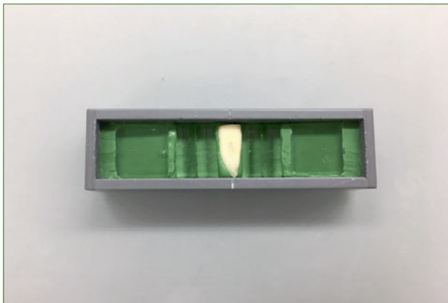
Fig 1 An embedded sample.

Abrasive dentin wear was then determined with custom-made software which superimposed the baseline and final profiles. The profilometric analysis has been described in detail in a previous publication. 1