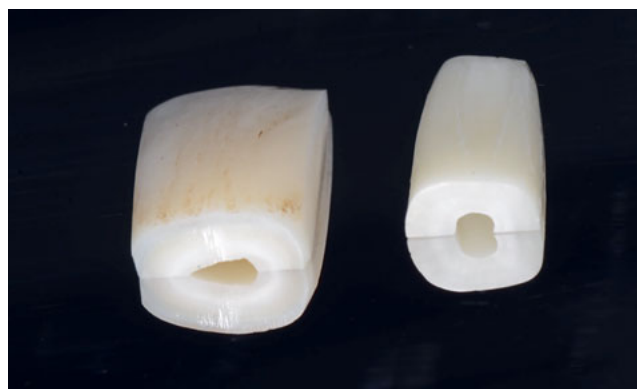
Fig 2 Enamel (left) and dentin (right) specimens.

A brushing sequence began by mixing the slurry and positioning dentin (RDA) or enamel (REA) specimens in the 8-place cross-brushing machine (V-8 Cross Brushing Machine). Standard toothbrushes (Paro M43, Esro; Thalwil, Switzerland) were then fixed in the machine. Using a spring gauge, the force applied by the brushes on the specimens