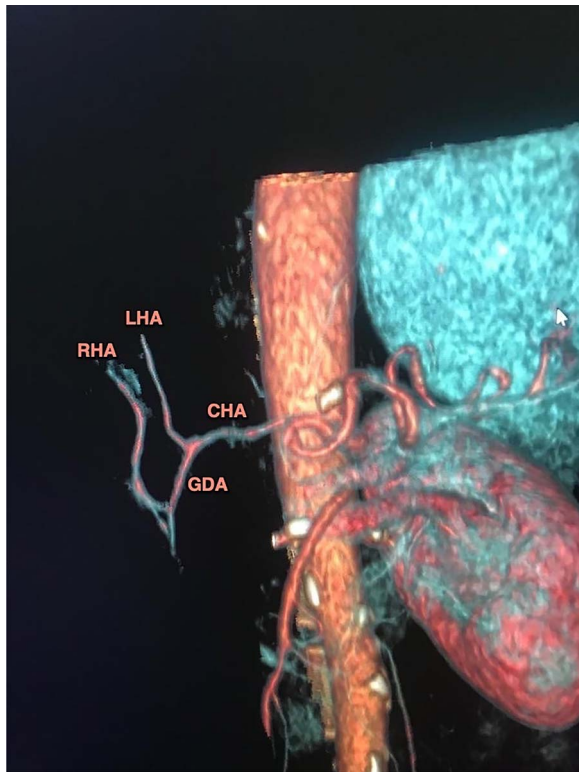
Figure 1: CT-based coronal 3D reconstruction shows the GDA runs down towards the pancreatic mass and the RHA arises from the GDA before entering the pancreas head.

and distant metastases, the tumor was assessed as resectable in the multidisciplinary board and the patient was scheduled for surgery. At this point, the preoperative imaging evaluation already identified a replaced right hepatic artery (RHA) arising directly from the gastroduodenal artery (GDA) (Fig. 1).