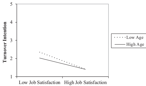
Figure 1. Plot of the interaction effect among job satisfaction and age on employees' turnover intention, Study 1 Sample 1.