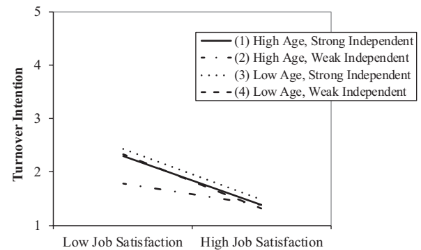
Figure 3. Plot of the three-way interaction effect among job satisfaction, age, and independent career orientation on employees' turnover intention, Study 1 Sample 1.

In total, 160 participants (The 95 people who dropped out included 27 people whose contact address was invalid, one person who passed away, and 67 people who were not interested in taking part in the survey.) answered the follow-up survey, representing a response rate of 63% at Wave 2. We removed 14 participants from the data set because of retirement ( n = 7 ), unemployment ( n = 1 ), or missing data on turnover ( n = 3 ; partial response = 1.2%; Newman, 2014). The effective sample size for the current study, therefore, was 149 (full response = 58%). For the assessment of attrition bias, all predictor variables as well as sociodemographic variables (gender, education, organizational tenure, and managerial position) were entered in a logistic regression analysis predicting the probability of being included in the effective sample (Goodman & Blum, 1996). Nonrandom sampling was only observed for education: Respondents with a Bachelor's or equivalent degree were more likely to belong to the final sample ( B = .70, p < .05, OR = 2.01 ) than respondents with a lower level education. Given that individuals with an independent career orientation tend to be better educated, this could have led to an attrition effect, but the analysis indicates that this was not the case as independent individuals were not more likely to