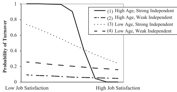
Figure 5. Plot of the three-way interaction effect of job satisfaction, age, and independent career orientation on turnover in Study 2. Note. The vertical axis represents the probability of turnover with 0 = “no probability of turnover” and 1 = “full probability of turnover.” The plotted probabilities were estimated by means of the logistic regression model.