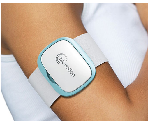
Figure 1: We used Biovotion’s Everion to collect biometric measurements from the participants