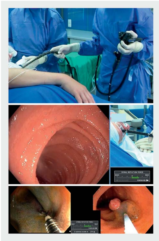
► Fig. 1 Images of motorized spiral enteroscopy being performed using the PSF-1 PowerSpiral enteroscope (Olympus Medical Systems Corporation, Tokyo, Japan), which is 1680 mm in length, with an outer diameter of 11.3 mm at the insertion portion, and has an integrated electric motor that is used to rotate a short disposable spiral overtube (240 mm in length, 31.1 mm outer diameter of the soft spiral fins) that is attached to a rotation coupler located 40 cm proximal to the endoscope's tip. For antegrade MSE, the study device is inserted through the mouth and advanced with the assistance of motorized clockwise spiral rotation. Marking of the deepest point (depth of maximum insertion) was done using ink dye injection and/or clipping. Therapeutic interventions were usually performed during the withdrawal phase.