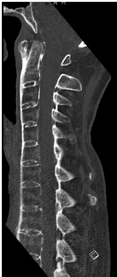
Fig. 1 Sagittal plane CT of the cervical spine of a patient in the AS group, an 80-year-old male