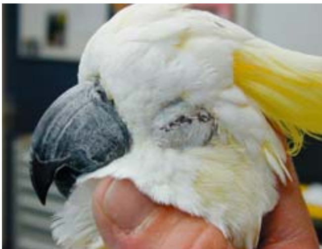
Figure 2: The same bird as in Fig. 1 one week after evisceration of the left eye.

The postoperative treatment consisted of prophylactic application of antibiotics (enrofloxacin, Baytril® 2.5%, Bayer, CH, 10 mg/kg, IM) for five days and antimycotics (ketokonazole, Ketokonazol-sirup, Streuli & Co AG, Uznach, Switzerland, 20 mg/kg, PO) for eight days and analgesia (carprofen, Rimadyl®, Gräub AG, CH, 4 mg/kg, SC) for three days. One week after surgery, the bird was presented for recheck. The wound had healed properly (Fig. 2).