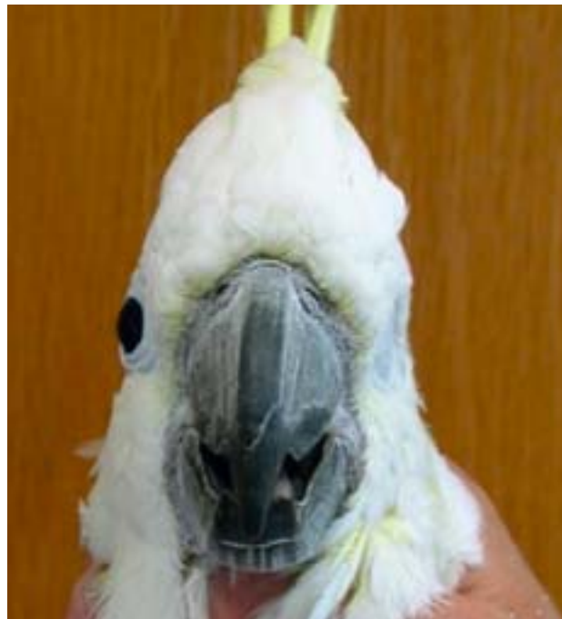
Figure 3: The same bird as Fig 1 two months after evisceration. This frontal view shows the planar surface of the evisceration site.

Two months after evisceration the cosmetic result was excellent (Fig. 3).