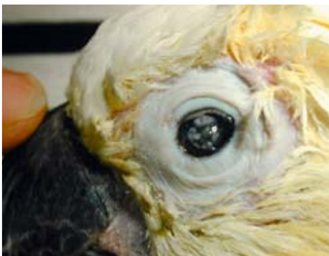
Figure 1: The left eye of a sulfur-crested cockatoo ( Cacatua galerita ) with a small subacute perforation of the central cornea, iris prolapse and extensive lipid degeneration of the cornea.

Upon presentation the cockatoo was in a good general and nutritional condition and with the exception of the left eye the clinical examination was unremarkable. The left eye showed blepharospasm and tearing. Slit-lamp examination (KOWA SL-14, Kowa, Tokyo, Japan) of the injured eye revealed a small subacute perforation of the cornea with iris tissue attached to the perforation site (iris prolapse) and a collapsed anterior chamber. Close to the perforation site extensive deep stromal whitish crystalline deposits were noted in the cornea (Fig. 1). Because ophthalmic examination of the remaining deeper structures was not possible an ultrasound examination of the left eye was performed. The lens was in situ and without signs of cataract. The vitreous cavity was diffusely hyperechoic and not distinguishable from the retrobulbar space, which was considered to be due to intraocular hemorrhage or possible rupture of the sclera. Inflammation, degeneration and neoplasia are further differ-