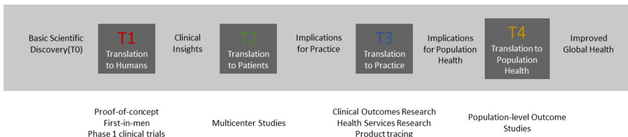
Figure 1. The process of translational research from basic scientific discovery to translation to population health [6].