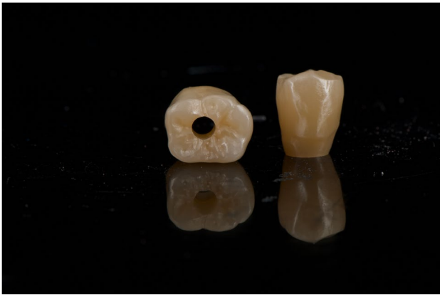
Fig. 2 Monolithic, highly polished 5Y-TZP implant crown

human eye, more precise in the retina, cone and rod cells register the light and send to the brain signals, which will be interpreted as colors [36].