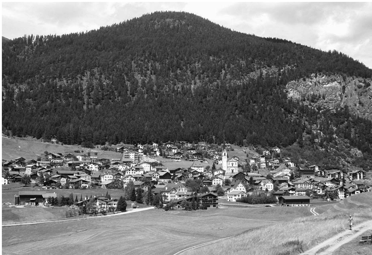
FIGURE 1 The village of Alvaneu, Canton of Grisons, Switzerland.

These studies elucidate that for tourists, visited places can be as deeply meaningful as for locals, notably as symbols of important experiences or because of the places' restorative value. But empirical studies focus mostly on defining the constituents of sense of place, or on the strength of place relations. Stedman's (2003) quantitative study in northern Wisconsin demonstrates that sense of place is not just based on social constructions, but also on some material reality, ie on concrete landscape characteristics. Hay (1998) found in a survey study on Banks Peninsula, New Zealand, that the sense of place of local Maori people is deeply rooted, whereas the sense of place of tourists is rather superficial, due to different residential status and thus different ancestral and cultural connections. Still, no studies have examined the contents and conditions of sense of place, particularly with regard to group differences. Empirical knowledge of differences in sense of place between the 2 main interest groups with respect to Alpine landscape development, locals and tourists, is especially poor.