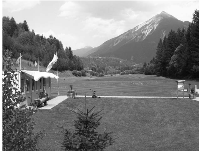
FIGURE 5 Eighteen-hole golf course in Alvaneu Bad.

pole. Some informants nevertheless described how some places became meaningful for them due to personal leisure activities. In their case, the key category remembered leisure activities lies close to the individual pole.