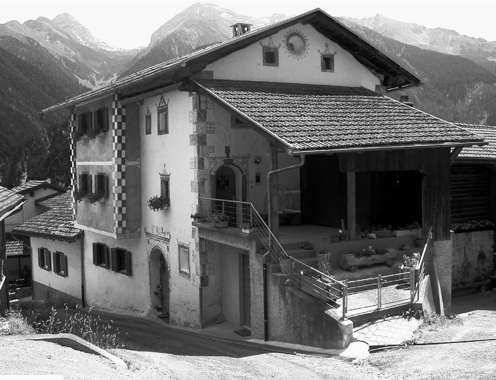
60 FIGURE 4 Construction in a traditional style, typical of Alvaneu.

friends and their common experiences of place. Furthermore, tourists seemed to be particularly satisfied if they got to know local people and especially proud if they established friendly relationships with them. Therefore, the key category personal relationships likewise encompasses individual and social aspects.