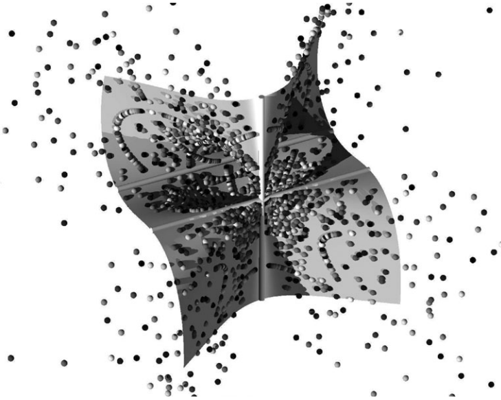
Fig. 1. Points of height \leq 100 on the D_5 cubic surface.

of S , together with all of the rational points of low height that it contains. The following is our principal result.