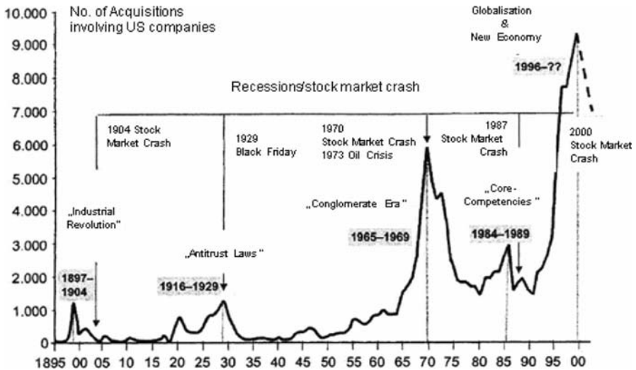
Fig. 1 M&A waves in the last decades.