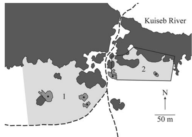
Fig. 1 Map showing the spatial layout of the major landmarks in and close around the experimental areas. The light grey areas show the experimental areas themselves. Area 1 is where the spider displacements took place. The black polygon shows the fence surrounding area 2 where the burrow displacements took place. The four medium grey areas are hummocks formed by Acanthosicyos horridus with heights approximately between 1 and 3 m. Dark grey areas are trees and shrubs, mainly Acacia erioloba , Faidherbia albida , Tamarix usneoides , and Salvadora persica with heights approximately between 3 and 10 m. The stippled lines are car tracks. The male spiders used in the experiments were found throughout the areas. In the well-populated research areas the distance to the nearest neighbour was almost between 3 and 8 m. The sex ratio is roughly 1 male to 3 females

Male spiders were found by searching for their telltale tracks in the sand in the early hours after sunrise (Henschel 2002; Nørgaard et al. 2003). Spiders identified as adult males (Henschel 1990; Nørgaard et al. 2006b) were dug up and marked with individual colour codes (small dots of non-toxic paint applied to the