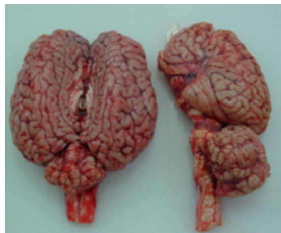
Fig. 3 The cerebellum of the CA foal at the left side compared to a normal one at the right side (half of a cerebellum)

tion nor inflammatory processes were seen in brain and spinal cord. An additional finding was a decreased size of the pars distalis of the pituitary gland interpreted as atrophy.