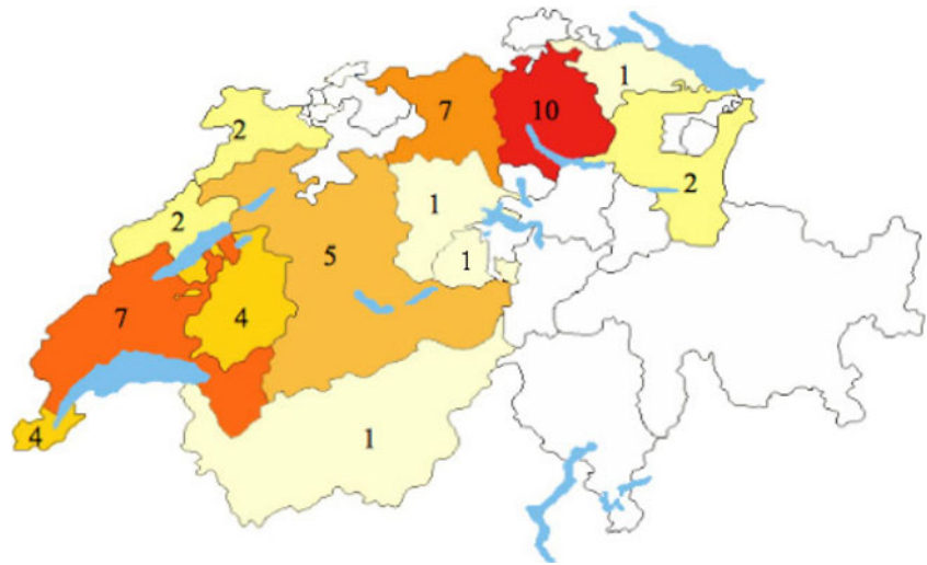
Fig. 1 Map of Switzerland with the 26 cantons. The numbers indicate the number of SBS cases declared during the study period ( n=49 )

Boys were more frequently affected than girls (31 boys and 18 girls, resp. 62% and 38%). Median age at admission was 4 months. Boys were younger (4 months; range, 1–15 months) than girls (5 months; range, 1–58 months) (Fig. 2).