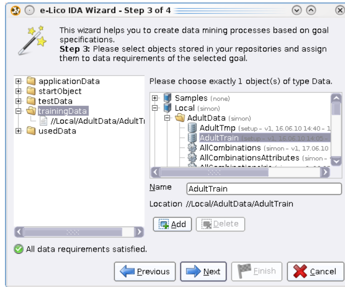
Fig. 5: A screenshot of the IDA planner integrated as a Wizard into RapidMiner.