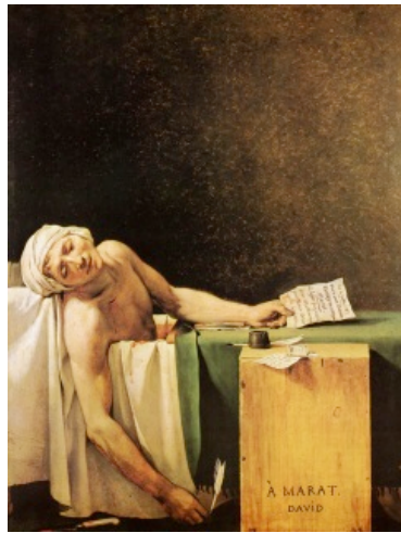
Figure 1 Jacques-Louis David (1748-1825): The murdered Marat

who had been imposed by a foreign power. Famous paintings depict the murder of rulers such as David's "The murdered Marat"(Figure 1).