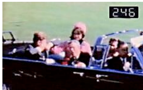
Figure 2 The assassination of President John F. Kennedy (photographed by Zapruder, and copied from Visipix)