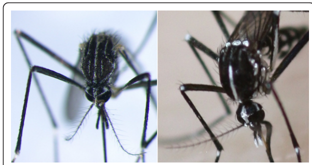
Figure 2 Particular of the mesonotum of Aedes koreicus (left) compared to Ae. albopictus (right).

albopictus , which is mainly based on the use of inexpensive ovitraps. The detection of the typical black Aedes eggs in ovitraps, easy recognizable by non-expert personnel, was sufficient to determine the infestation status of a location with regard to the tiger mosquito. Unfortunately, tiger mosquito eggs are indistinguishable by simple observation under a binocular microscope from the eggs of other Aedes spp., including those of Ae. koreicus . Hence, the species identification at a routine basis in areas where Ae. albopictus and Ae. koreicus may share the same breeding sites, will require to rear the eggs in the laboratory or to include into the surveillance system the more laborious systematic collection of larvae and adults, which require an equipped laboratory and well trained personnel for identification (Figure 2).