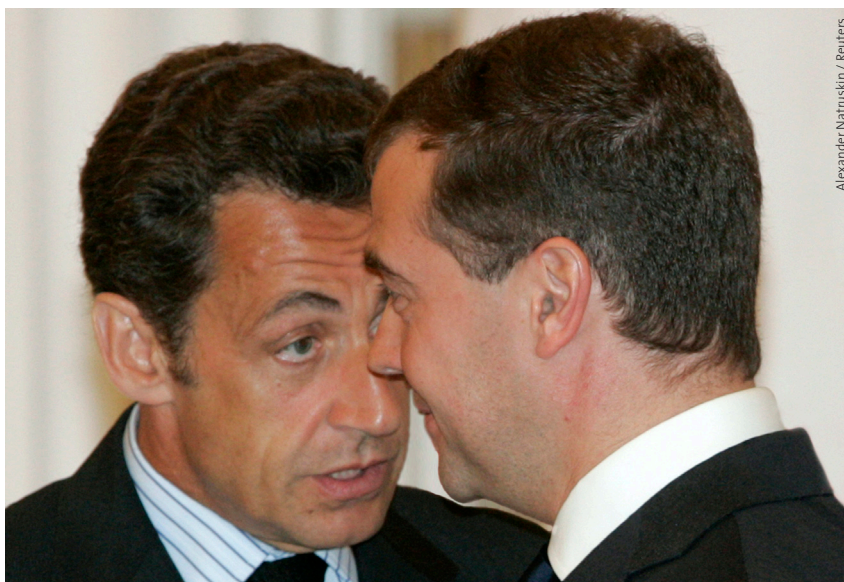
Alexander Natruskin / Reuters

Following Russia's military intervention in Georgia and its recognition, in contravention of international law, of South Ossetian and Abkhazian independence, the Caucasus has returned to the focus of security policy attention. Georgia's attempt to retake South Ossetia by military force and the demonstration of Russian power have called into question some important parameters of the European security framework. The unstable situation in the Caucasus also threatens to undermine European efforts to reduce its energy-policy dependency on Russia. The West's options are limited, since an isolation of Moscow would be counter-productive.