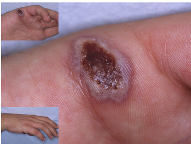
Fig. 1 Ulcer of 1 cm in diameter with undermined edges, covered with a gray–brown membrane. Erythema on the back of the right hand and over the fourth and fifth fingers (lower inset photograph)