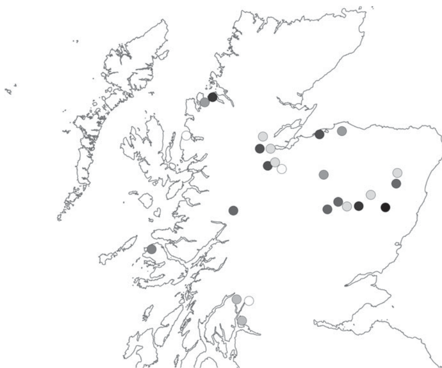
Fig. 1. Prevalence of Borrelia burgdorferi s.l. in questing nymph Ixodes ricinus ticks in woodlands in Scotland. Gray scale denotes prevalence, ranging from the lowest (white) at 0.8% to the highest (black) at 13.9%.

Nymph I. ricinus ticks were assayed from 1218 individual blanket drags for B. burgdorferi s.l. (we did not have the time and resources to assay nymphs from all drags, but we ensured that we assayed a minimum of 50 nymphs from each site). The prevalence of B. burgdorferi s.l. at each site was calculated as the number of positive nymphs/number of nymphs assayed per site. The overall prevalence in questing nymphs from all 25 sites was 5.6% ( \pm 1.0\% , range 0.8–13.9%, Fig. 1). Of those positive samples that we successfully identified to genospecies level, 48% were B. afzelii , 36% B. garinii , 7% B. burgdorferi s.s., 8% B. valaisiana and 1% carried mixed infections of 2 or more genospecies. The number of samples successfully identified to each genospecies was not large enough for conducting meaningful statistical analyses to test for predictive environmental variables, so this was done only for B. burgdorferi s.l. prevalence as a whole, at the site level.