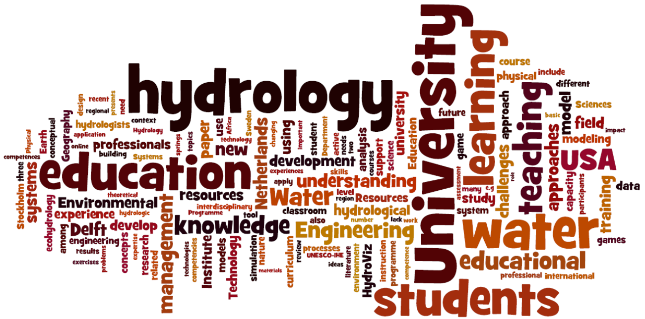
Fig. 1. Word cloud based on all abstracts of the HESS Special Issue on “Hydrology education in a changing world” (generated using Wordle™).