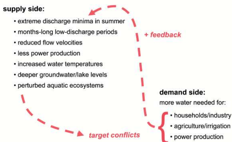
Figure 4. Possible future water stress: conditions of the extreme, hot/dry summer of 2003 in the last decades of our century with essentially deglaciated Alps and melting of the seasonal snow cover advanced in time by several weeks.

climate scenario indeed developed by looking at the fate of mountain glaciers all over the world. Their continued shrinking and vanishing can be seen as an important ‘writing on the wall’ – with the glaciers in the European Alps being among its best recognizable letters.