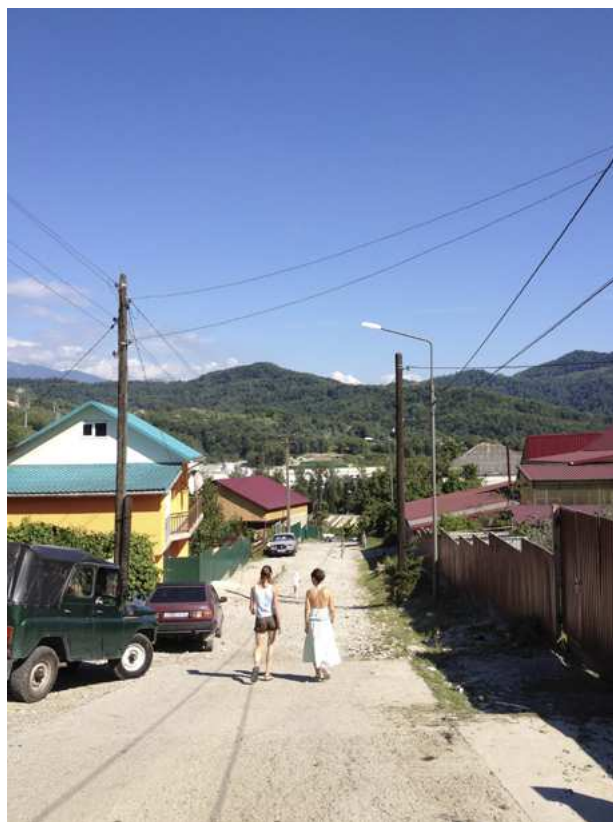
Figure 2. Locals walking in Kazachiy Brod in 2013. New houses, new fences, new streetlights.

Krasnaya Polyana. Every spectator and athlete will pass these villages repeatedly during the Games; aside from helicopter, there is no other way to travel between the Olympic Clusters. Figure 1 shows the location of Kazachiy Brod and Akhshtyr' in relation to Adler, Sochi, and the rest of Europe. Figure 2 shows a snapshot of Kazachiy Brod in 2013. Every house visible in the picture was built after 2007. Figure 3 shows houses in Akhshtyr' surrounded by new power towers, along the construction road that leads through the village to the new quarry.