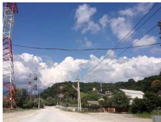
Figure 3. Houses on the construction road to Akhshtyr' in 2013. New power lines and towers.

(Author interview: Kazachiy Brod resident "A", August 25, 2013.)