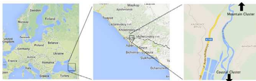
Figure 1. Kazachiy Brod and Akhshtyr', between the two clusters of Olympic sites in Sochi, Russia