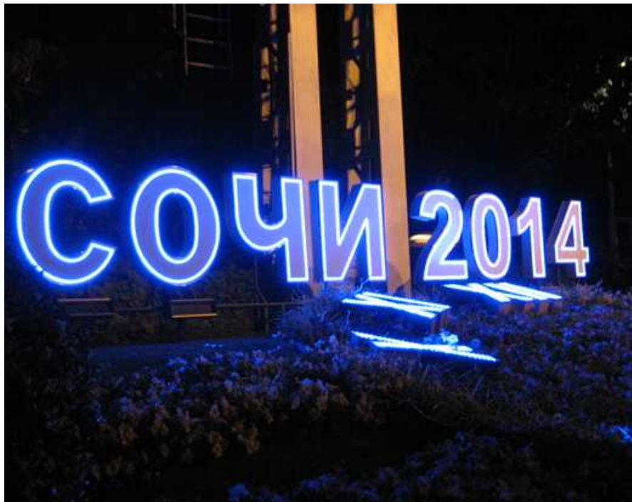
The Olympic clock is ticking... neon installation when entering Sochi, August 2009.

Online Journal of the Center for Governance and Culture in Europe University of St. Gallen URL: www.gce.unisg.ch , www.euxeinos.ch ISSN 2296-0708