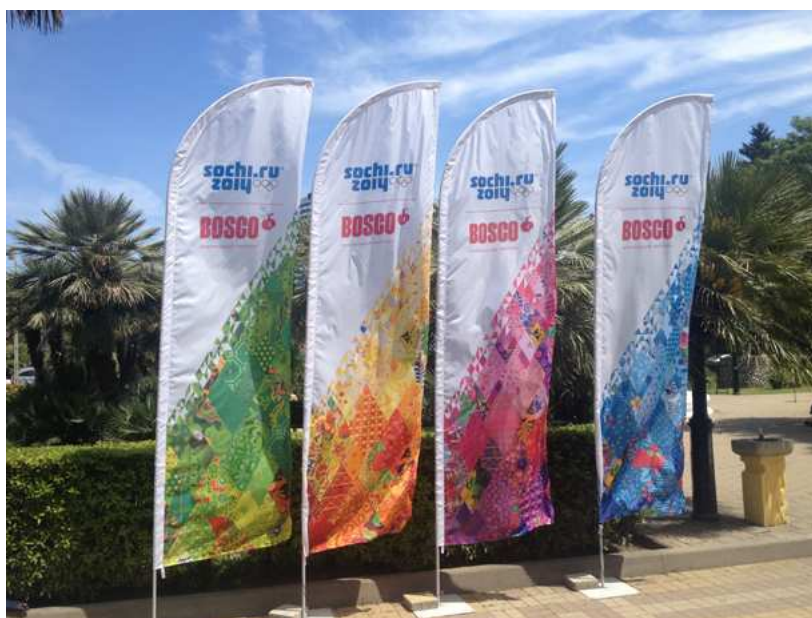
Image 2. The patchwork pattern of Sochi-2014

The image-language used in connection to Sochi-2014 tells the same story. Advertisements, flags and posters, as well as official merchandise in the form of clothes, keyrings, stamps, bags etc make use of the patchwork pattern (see images 1-2), a practice which can be described as a commodification of cultural diversity.