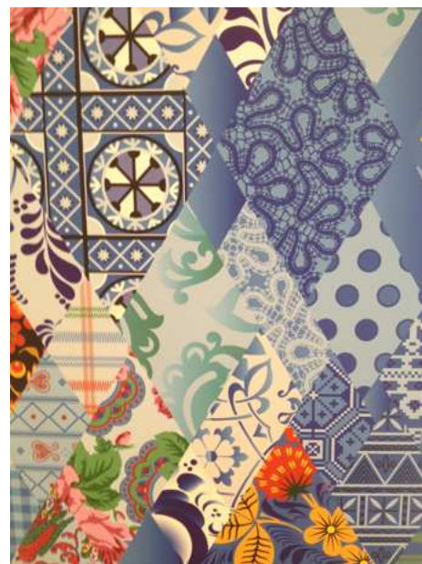
Image 1. The patchwork pattern of Sochi-2014

The above slogan, in Russian, written over a map of Russia with an artistically designed patchwork pattern, was part of an advertisement campaign distributed on television, Internet, as well as on huge outdoor TV screens in Sochi during my fieldwork in the city in May 2013. The one theme in the official narrative about Sochi-2014 which is being disseminated most consistently – in the rhetoric of politicians and Olympic officials, in advertisements and slogans, in the merchandise products designed for the Games – is that Russia is a culturally diverse, tolerant and open country. In the section "brand" on the official webpage of Sochi-2014, we can read that the Games will promote an image of Russia as a "country that is committed to equality and celebrates diversity" (sochi2014.ru a). President Vladimir Putin, who since the start has invested