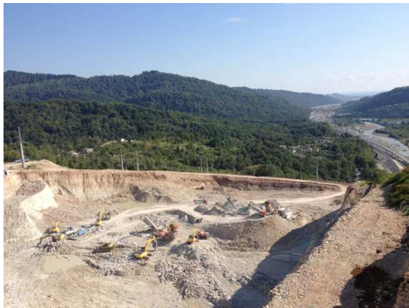
Figure 5. New quarry, set against the backdrop of the houses of Akhshtyr', 2013.

lage (see Figure 5). The presence of the quarry is highly disturbing to residents. The drilling noise is ceaseless and can even be heard across the river in Kazachiy Brod, but in Akhshtyr' it is oppressive and inescapable. Work continues at night by the light of powerful spotlights. This activity creates a constant cloud of pulverized rock dust which is a daily disturbance to villagers. Finally, and perhaps most importantly, the quarry itself represents the illegal destruction of a staggering amount of protected wilderness in a national park. Complaints